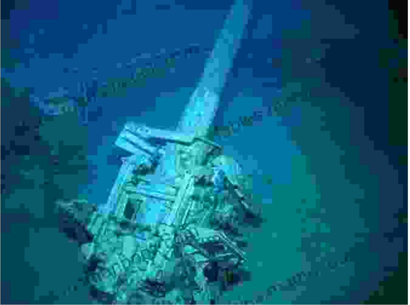
The wreckage of the SS Cotopaxi, a steamship that vanished in 1925