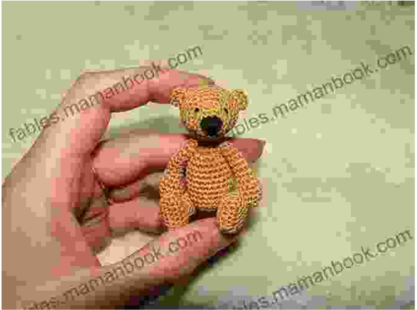
A closeup of the face of an Amigurumi Erwan the Bear